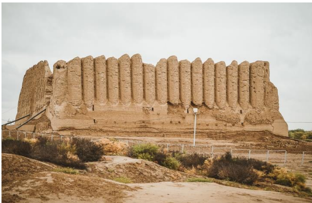
Large Gyz Gala

Breakfast at the hotel. Free time till noon. From Hotel drive to Mary . In Mary you will have lunch. Then drive to Ancient city of Merv (UNESCO) discover historical park with Sultan Sanjar Mausoleum, Small and Large Gyz Gala, Muhammed ibn Zaid Mauseleum and Some Ruins Keshk fortress etc. Then come back to Ashgabat to the hotel.