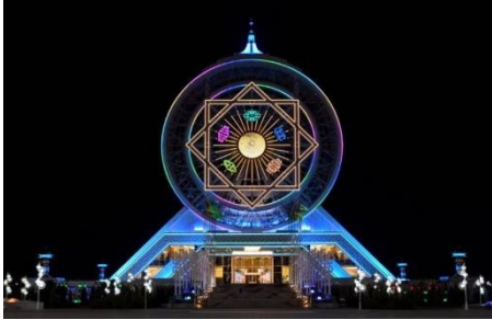
“Alem” Ferris wheel

Greeting from International airport . You will see the Wedding Palace, modern “Yildyz” Hotel, Constitution Monument, Arch of Neutrality, Monument and Park of Independence, Ertogrul Gazy Mosque in Ashgabat. Horse farm, Akhal-teke Horse stable (riding opportunity) in traditional style. Overnight in hotel in Ashgabat.