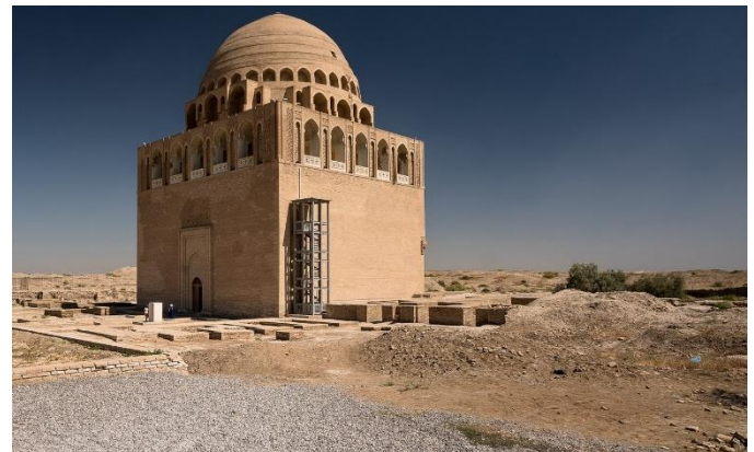
Sultan Sanjar Mausoleum

Breakfast at the hotel. Free time till noon. Hotel check-out and drive to Darvaza burning Gas Crater (275km, 4h) which is one of the top international tourist destinations. The area is rich in natural gas. Burning for more than 50 years, Darvaza Gas Crater shines like a pearl in the middle of the Karakum desert. Besides Darvaza